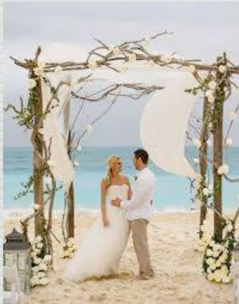
Rustic Style with Wood