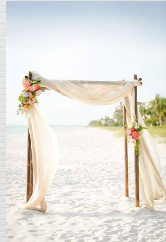
Bamboo & Cotton