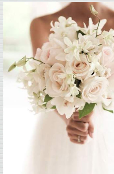
SWEET & SIMPLE